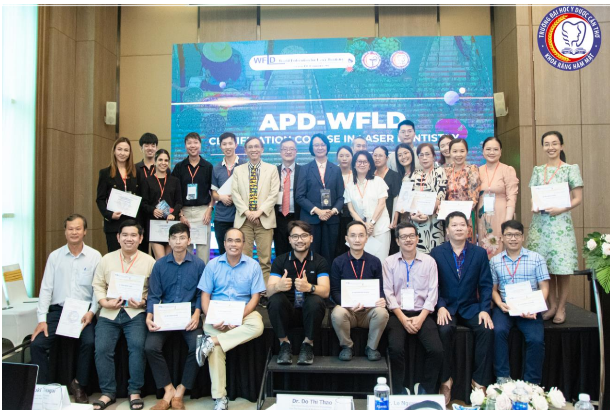
The participants received the certificates from ADP_WFLD and CTUMP