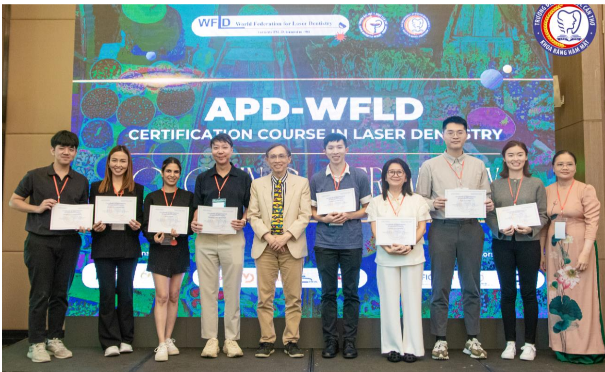
The participants from Thailand, Philippines, Australia, Hong Kong, Taiwan received the certificates from CTUMP