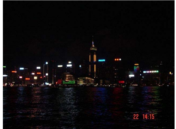
The night lights of Hong Kong.