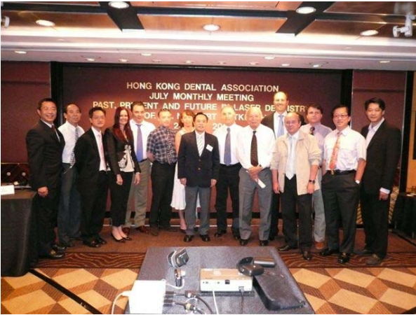
WFLD visiting The July Monthly Meeting of The Hong Kong Dental Association.