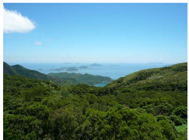
A beautiful view from the statue of the Buddha.