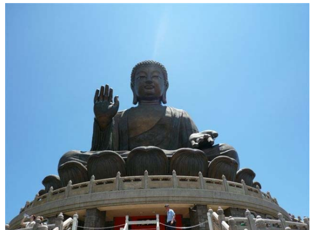
World's biggest sitting Buddha in bronze.