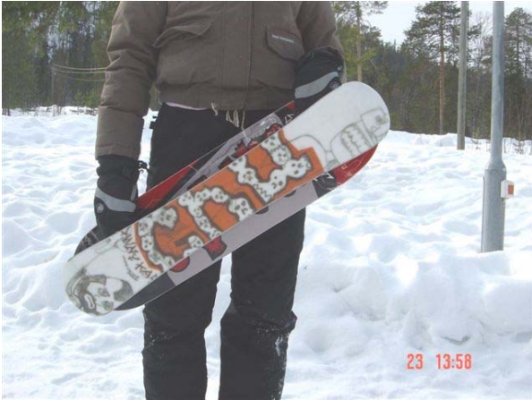
A snow-skiboard from beneath.