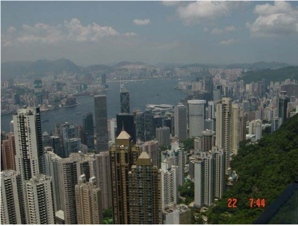
A panoramic view from the Victoria Peak.