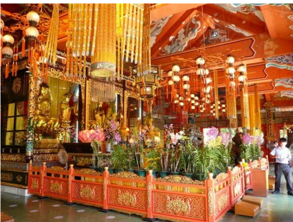
Ceremony decorations in one of the temples.