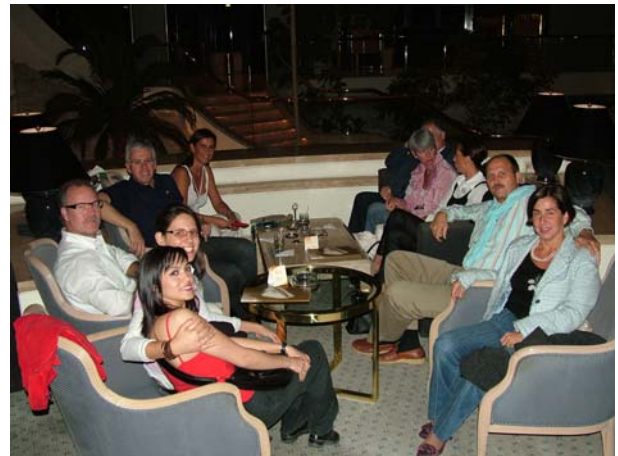
The invited speakers relax after the congress.