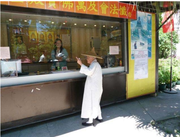
A monk from the Po Lin Monastery.