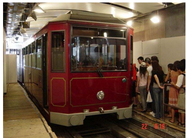
A cable car taking visitors to Victoria Peak.