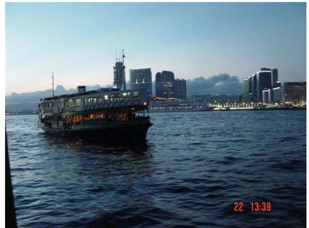
A ferry boat on Hong Kong bay.