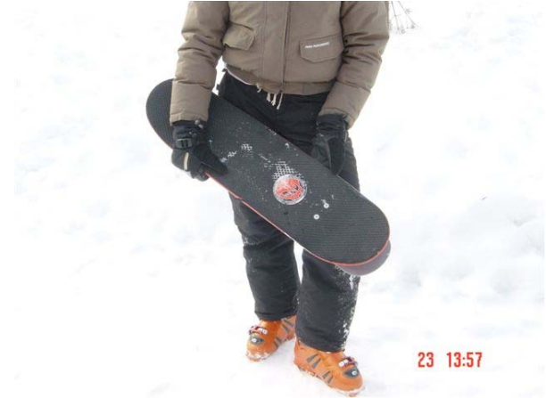
The snow-skiboard from the top.

Best regards to all fellow members of WFLD!