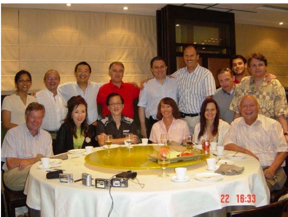
WFLD executives with their spouses meeting the local organizers.

WFLD officials visited Hong Kong in July 2007 and met the Hong Kong congress local organizers. The discussions took place at L`hotel Nina Congress Center. The Exos and the local leaders had vivid discussions of the practical arrangements of the congress. A vote had to be taken among others on choosing the congress venue. WFLD executives made it clear that they will give all possible support needed to the local organization committee.