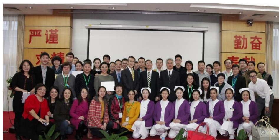
Group photo-Peking Union Medical College Hospital, Beijing