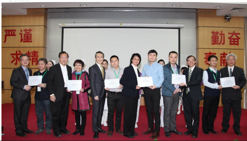
Certificates were presented to the participants by the esteemed speakers.

Furthermore, a special thanks to the interpreters and the audio-visual technical officers of these symposia.