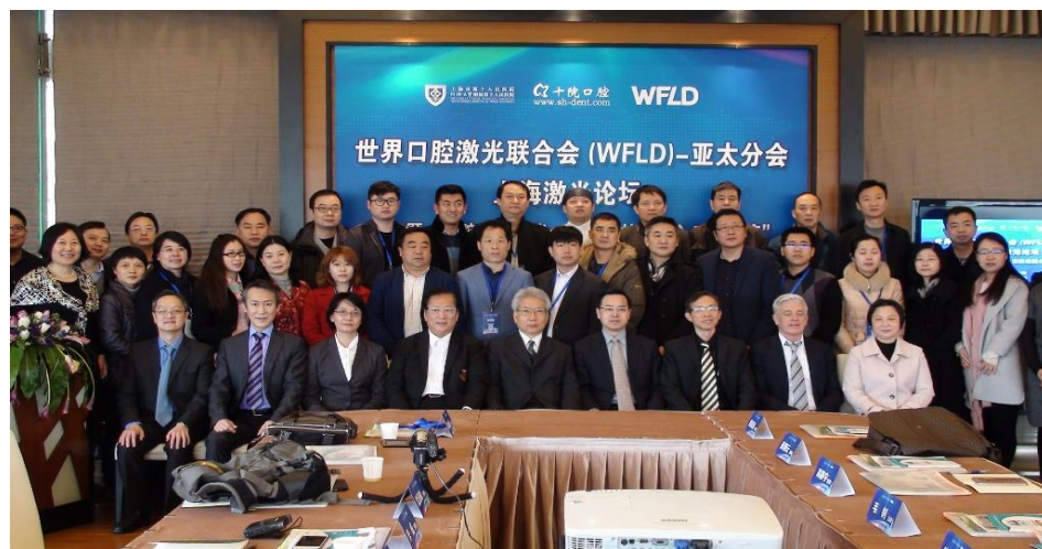
Group photo- Tenth People's Hospital, Tongji University , Shanghai

While some audiences were watching live-patients demonstration