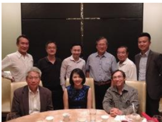
Welcome dinner by Q&M