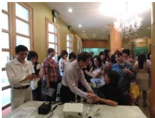
LILT Demo at the break