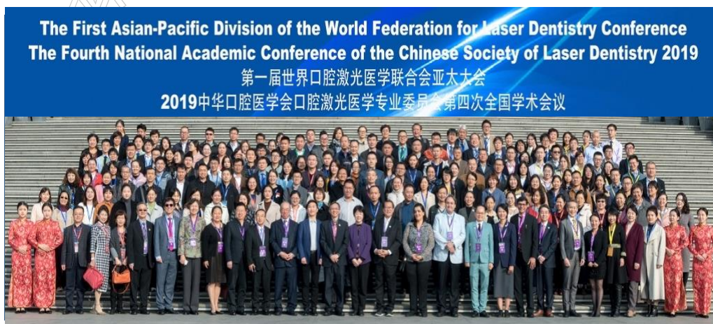
First APD-WFLD Conference -Esteemed Guests, Speakers, Delegates and Chinese Stomatological Association (CSA)-CSLD, CISTE, APD and the local organizing teams